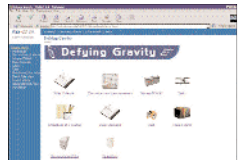
The DG website runs on Web Ed software.